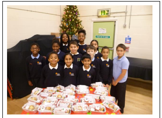
Our choir sang for the residents at The local nursing home