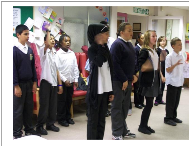
Pupils visited the nursing home and Read and talked to some of the residents